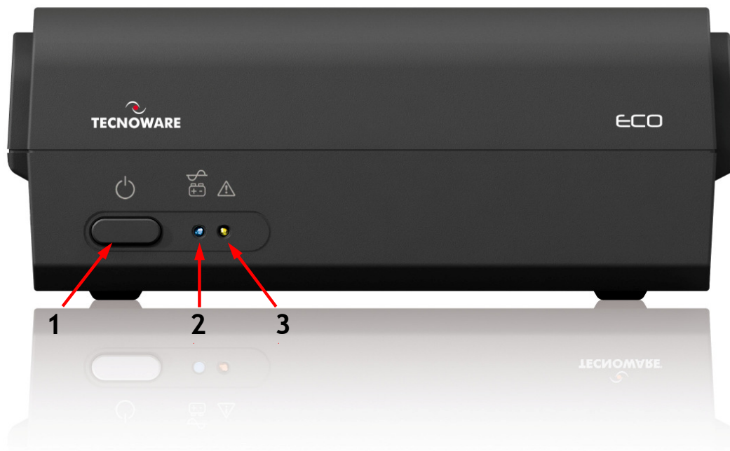
Figure 1 - Front panel