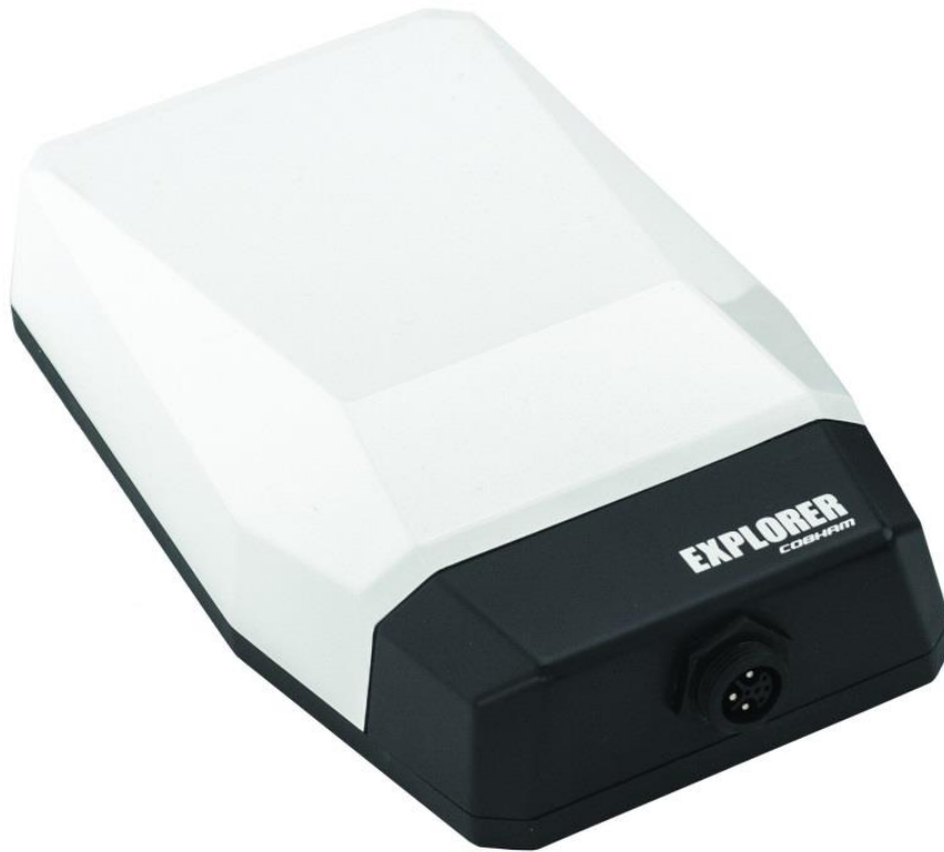
EXPLORER 122 Terminal

This quick start guide contains the basic information about getting your EXPLORER 122 Terminal up and running.