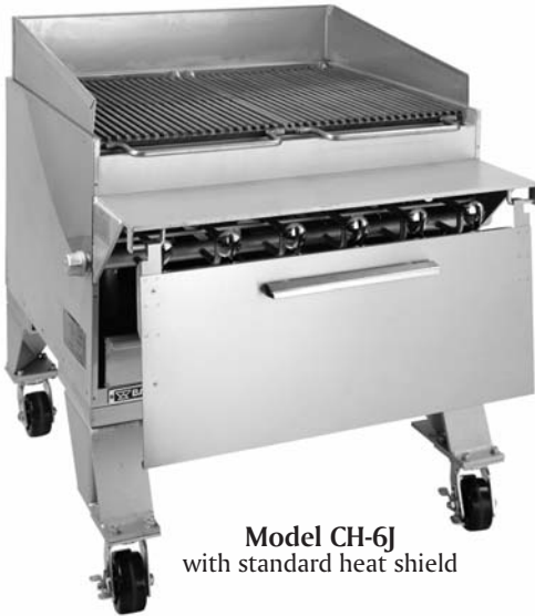
Model CH-6J with standard heat shield