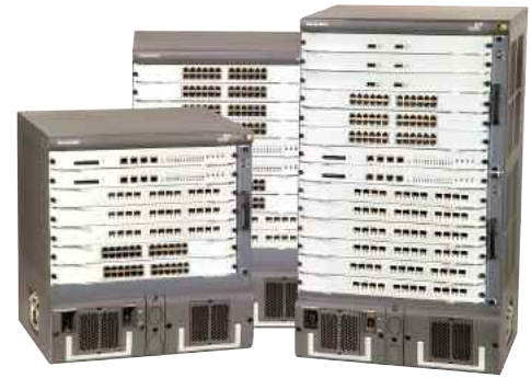
from left: 3Com Switch 8807, Switch 8810, Switch 8814

A high-performance, multilayer modular switching platform for the most demanding Enterprise environments, driving secure, non-stop delivery of business applications