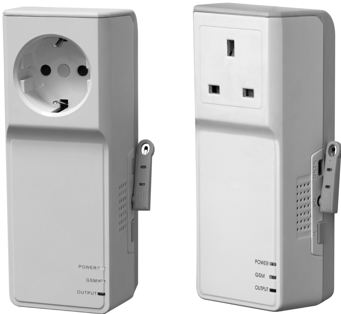
GSM POWER SOCKET